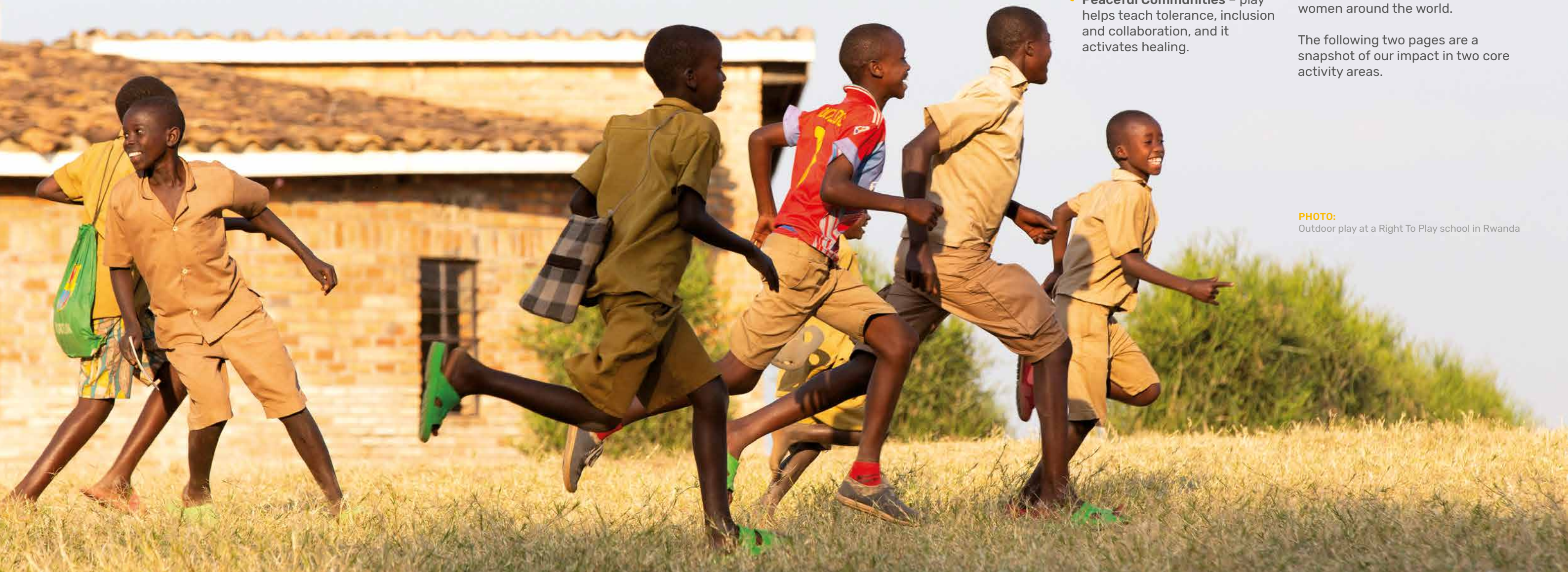
PHOTO: Outdoor play at a Right To Play school in Rwanda

The following two pages are a snapshot of our impact in two core activity areas.