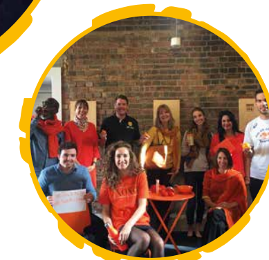
BELOW: Right To Play UK team take part in Xiaomi's 'Paint Mi Orange' campaign

In October Right To Play was selected by global technology leader Xiaomi as the charity partner for its UK launch. As part of Xiaomi's 'Paint Mi Orange' launch campaign, Xiaomi fans and Right To Play supporters uploaded photos wearing orange – the colour is both Xiaomi and Right To Play's brand colour. The campaign raised US $25,000.