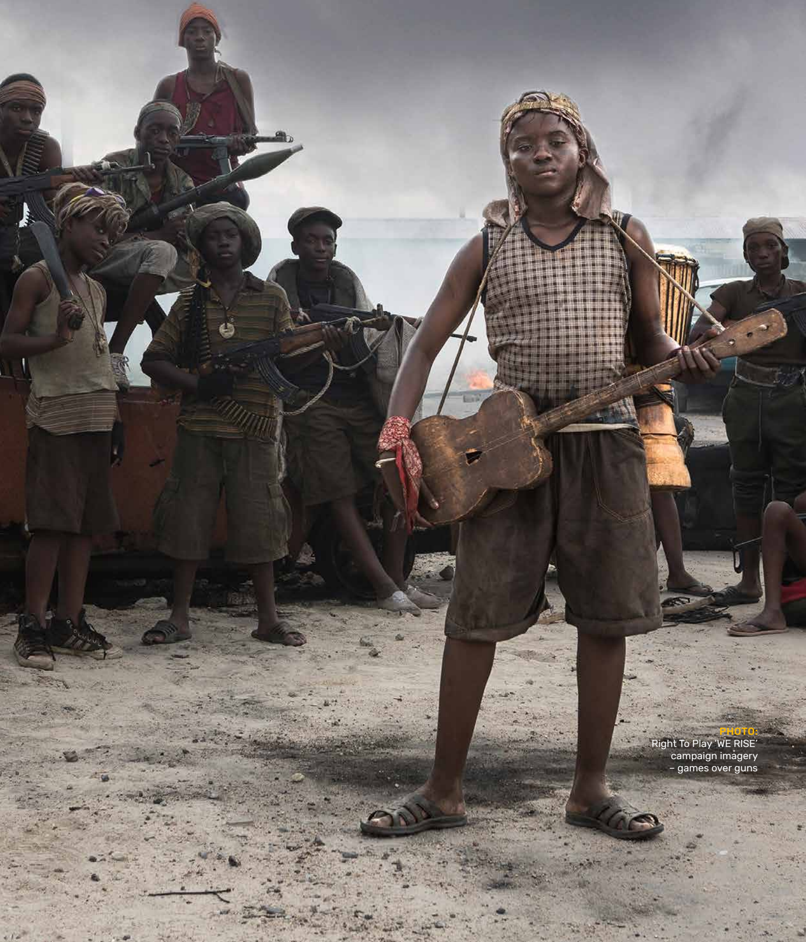
PHOTO: Right To Play 'WE RISE' campaign imagery - games over guns

Right To Play Limited | Registered company number: 05441373 | Registered charity number: 1112404